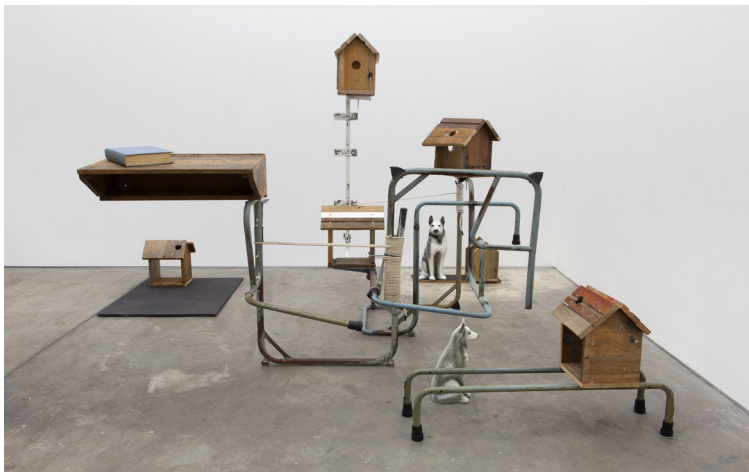
Kemang Wa Lehulere, My apologies to time 1. 2017 Salvaged school desks, african grey parrot, wood, steel, string, spray paint.